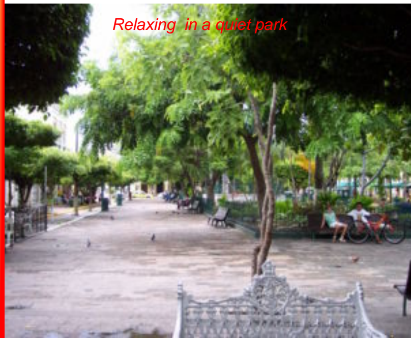
Relaxing in a quiet park

So be very aware, keep your eyes open, and as my Mother always said, keep your nose clean. Be careful – much as you would be in Los Angeles or Miami.