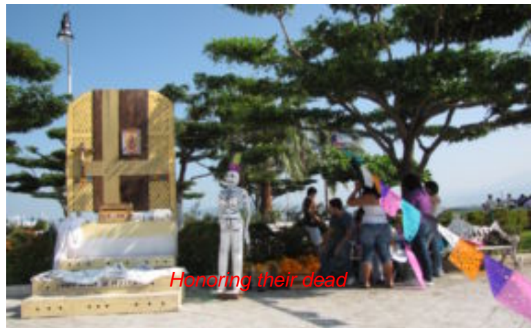
Honoring their dead

You'll find the people of Mexico have a deeply rooted culture, strong in religion and in family.